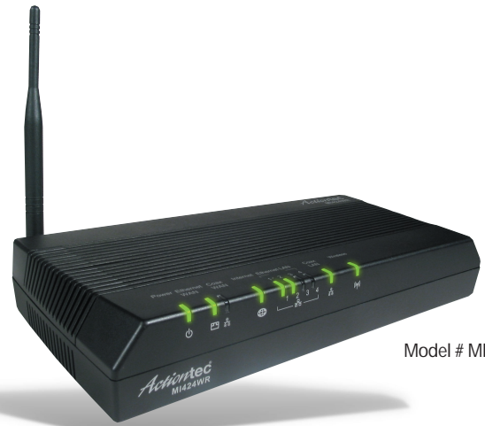
Model # MI424-WR

A high-end CPU (capable of processing as much as 80 times the throughput as earlier-generation broadband routers) makes it possible for the Wireless Broadband Router to handle multiple high-throughput media streams simultaneously, including standard and HDTV-based video programming. Networks can be set up to feed personal video recording functionality from a single set top box or other digital storage device to any TV in the house. The router also supports Ethernet and Wi-Fi as well as coax networking, and it allows telcos to assign bandwidth priorities for data, video on demand and voice over IP traffic to ensure quality of service in triple play environments.